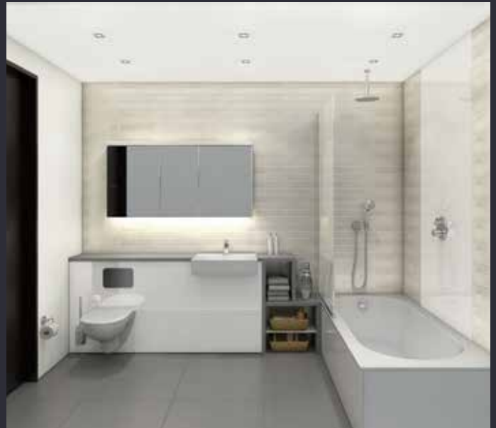
Images is indicative of interiors